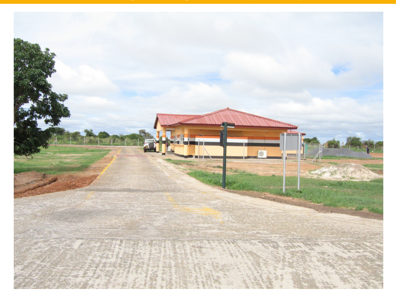
23e Congrès mondial de la Route - Paris 2007