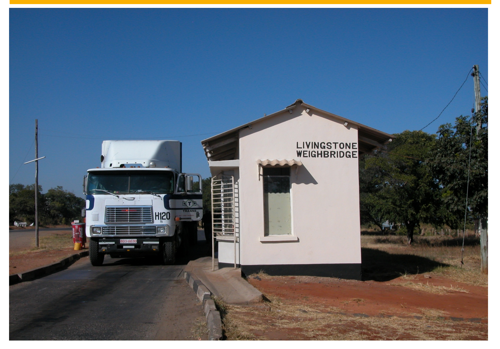
23e Congrès mondial de la Route - Paris 2007