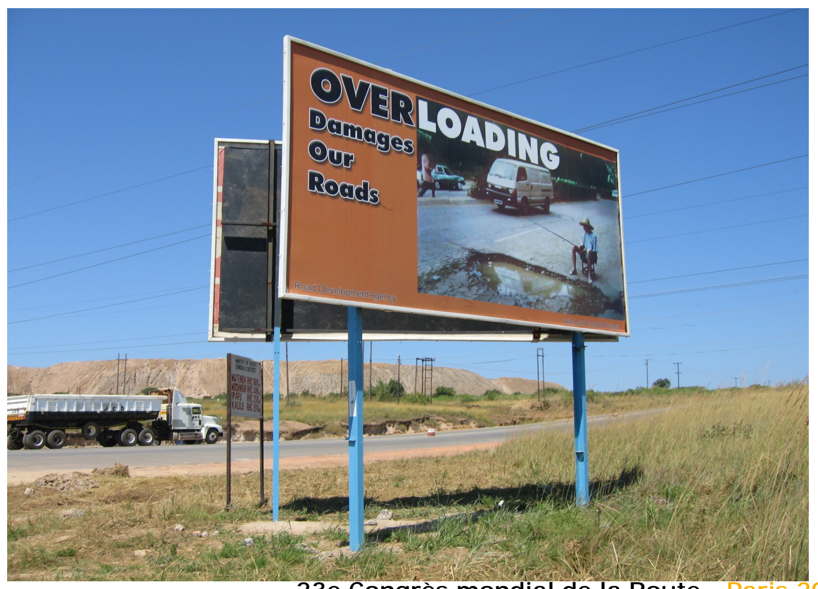
23e Congrès mondial de la Route - Paris 2007