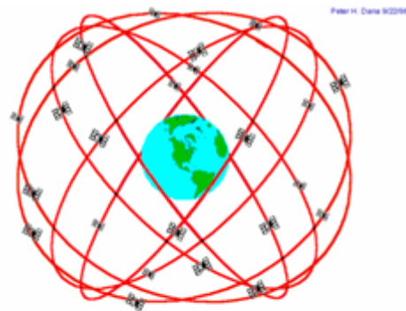
GPS Nominal Constellation 24 Satellites in 6 Orbital Planes 4 Satellites in each Plane 20,200 km Altitudes, 55 Degree Inclination